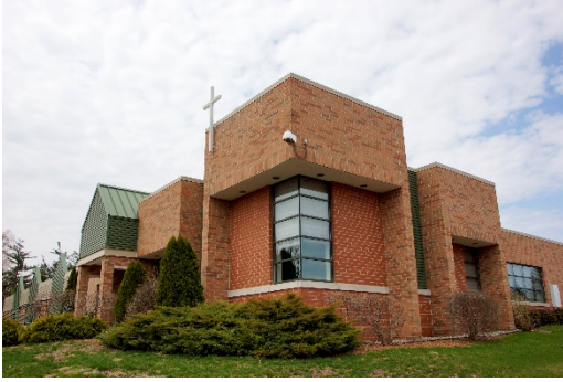
St. Vincent Catholic Charities Children's Home